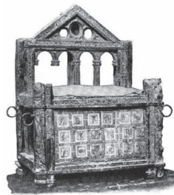
CHAIR OF ST. PETER (Vatican Basilica)