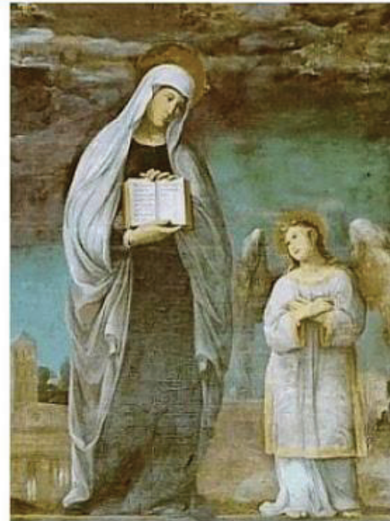
St. Frances of Rome (1384 - 1440)

Group We warmly invite you to join us for a very special Passion Play at St. Ambrose Church on Friday, March 20 th at 7:00 p.m. This beautiful and prayerful presentation of Christ's Passion will be led by our dedicated Youth Group , who have been working hard to bring this sacred story to life. Come and enter more deeply into this holy season as we reflect on the love and sacrifice of Jesus. Your presence and support mean so much to our young people and encourage them in their faith journey. Please join us for this meaningful and powerful evening. Let us walk together through this sacred time. ✚